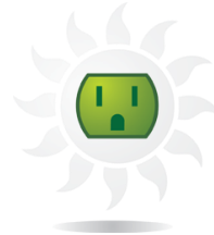
Electricity Used/ Produced

Benefiting from innovative financing and incentive programs offered in Colorado for the use and incorporation of renewable energy, the NWP paved the way to make the most out of its available Right-of-Way. Besides its economic value, NWP was mostly driven by its social and environmental value added. Thus far the project produced about 654,000 kWh, offsetting the equivalent of about 589 tons of CO2 emissions!