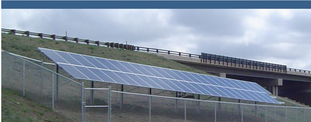
Solar site on the NWP Right-of-Way slope.